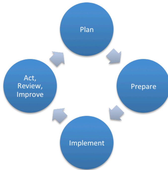
Figure 3: Stakeholder Engagement process

Having established the purpose, scope and stakeholders for the engagement, the owners of the engagement now need to ensure that there is a quality stakeholder engagement process in place. The AA1000SES (2011) stakeholder engagement process consists of four stages: Plan; Prepare; Implement; and Act, Review and Improve.