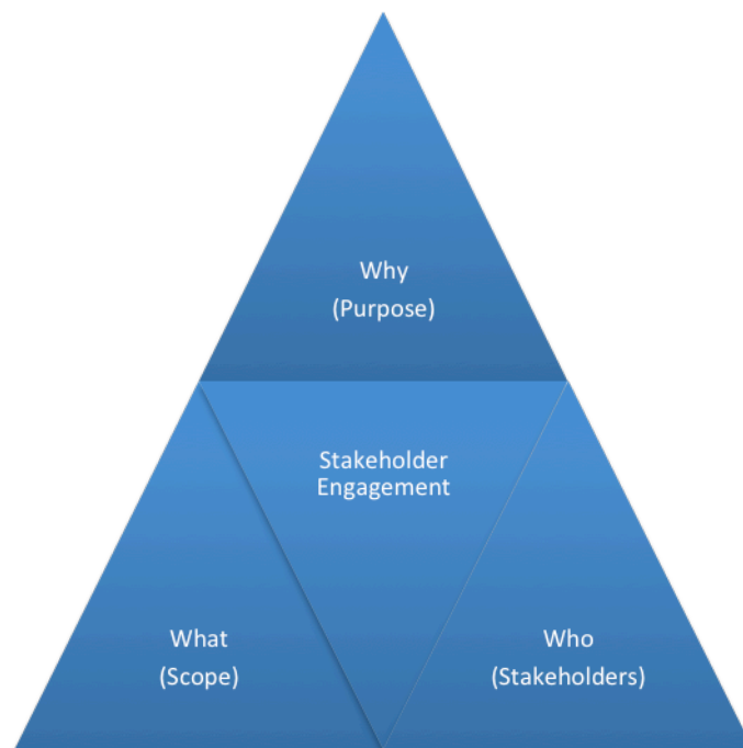
Figure 2: Purpose, scope and stakeholders

Successful engagement depends on understanding why to engage (the purpose), what to engage on (the scope), and who needs to be involved in the engagement (ownership, mandate, stakeholders). The commitment to the AA1000 Accountability Principles and the integration of stakeholder engagement into governance, strategy and operations require stakeholder engagement to be used systematically and regularly across the organisation.